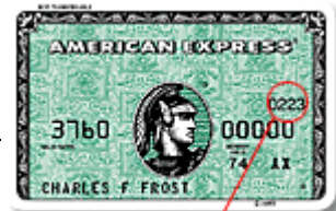
Card ID #

The Card ID is a 4-digit number located on the FRONT of your card above the card number